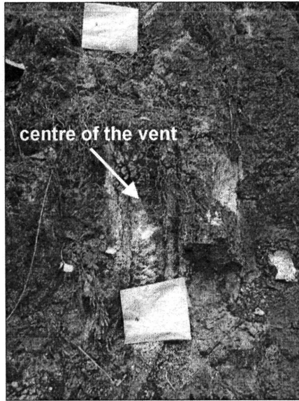
6. Picture of a carbonate cone situated out of the vertical section